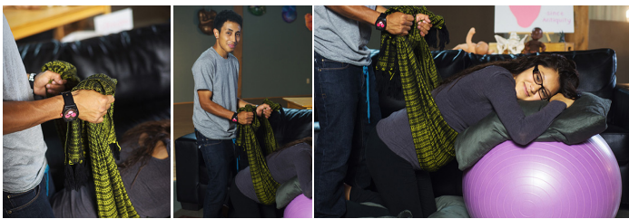
L-R: Holding the ends of the Rebozo with straight wrists prevents strain. Lift baby's weight straight up. While lifting steadily, make small circles with Rebozo.

Kneel in front of a chair, couch, or birth ball. Use pillows under knees and chest for comfort. Drape your arms over the ball, chair or couch. Relax the upper body into the Rebozo without sinking. Now you are in position to start.