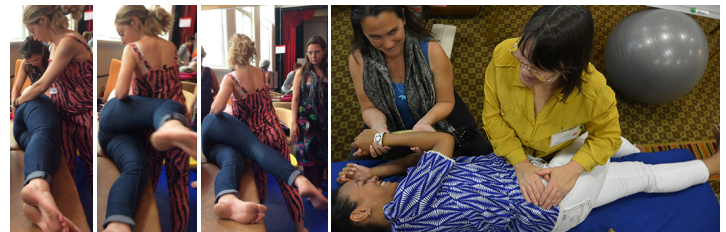
L-R; Sidelying Release: begin on edge, lift top leg, let leg hang freely. Wait for it.

Start on either side, but do BOTH sides to avoid imbalance. Choose a firm surface such as a couch or bed. Your head is level on a pillow, not tilted. Hold a chair or table so your top shoulder remains stacked.